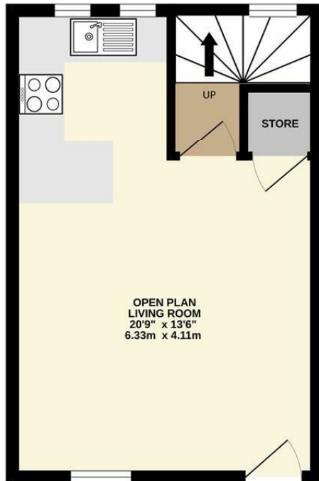
GROUND FLOOR 280 sq.ft. (26.0 sq.m.) approx.